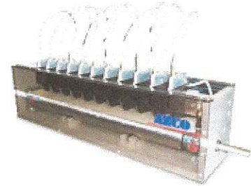
Crush Cut Slitter

FAIRFIELD, NJ | Azco Corp. offers the AcuSlit slitter module , a rotary system featuring a solid, hardened anvil and blade materials that are through hardened D-2 steel. Each unit is equipped with precision bearings designed to handle high load forces, as well as precision machined steel side frame plates. Reportedly, the unit can be mounted on any production line and perform a variety of tasks from simple slitting to motorized slitter functions that cut dense materials.